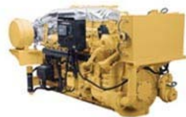
Cat 3512C ACERT Genset