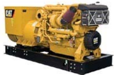
Cat C18 ACERT Genset

In June this year, Singapore Technologies Marine (ST Marine) – the marine arm of Singapore mainboard listed ST Engineering, announced that it had won a shipbuilding contract worth about S$171 million from Swire Pacific Offshore Operations (Pte) Ltd (SPO) to build and outfit four Anchor Handling Tug Supply (AHTS) vessels.