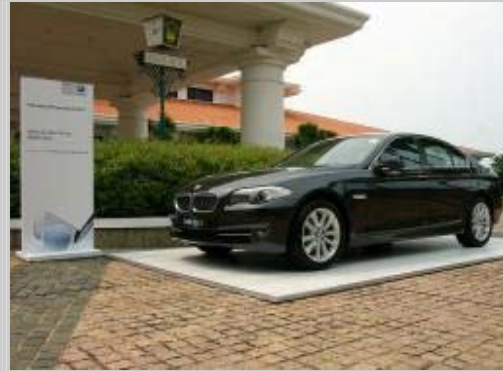
<L-R>: Members from TSL prompting guests to contribute to the charitable cause. The hole-in-one prize – a BMW 523i - sponsored by Performance Motors Limited.

Tractors Singapore Limited (TSL) held its 9 th Customer Golf Tournament and Dinner at the Sentosa Golf Club on 9 th September 2011.