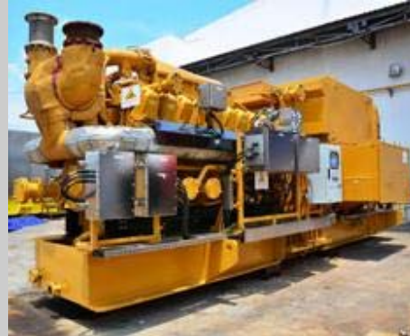
Cat Gas Engine Genset G3520C

Sime Darby Industrial, Power Systems has supplied one unit each of Cat G3520C (1800kW) and Cat G3306 (88kW) for Petroleum application and custom-made by Caterpillar Custom Solutions for the Sabah-Sarawak Gas Pipeline project. These two units of Gas Engine Generator sets (GEG) are designated for installation and commissioning in two different stations, namely Bintulu Regional Office (BRO) and Bintulu Metering Station (BMS) respectively and will be operated by Malaysia National Oil Company, Petronas Gas Berhad.