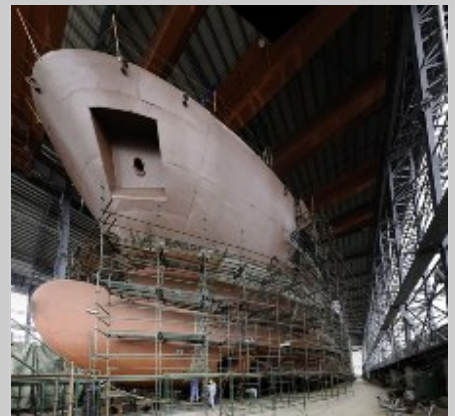
A Platform Supply Vessel being built at PAXOcean's shipyard in Zhuhai

TRACTORS SINGAPORE LIMITED RAISES MORE THAN $20,000 FOR CHARITY AT ITS CUSTOMER GOLF TOURNAMENT AND DINNER 2011