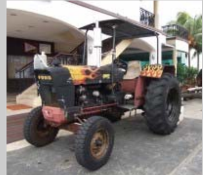
"Trustworthy Grandpa – Ford Tractor 5000"

With an impressive fleet of 270 crafts in its inventory and offering craft storage space at its Changi and Sembawang Club houses for both dry storage and marina walk-on berthing to the public, the SAF Yacht Club has put their 30 year old plus Ford tractor model 5000 fondly nicknamed "Grandpa" to the test and literally worked it well. "Grandpa" was the Club's asset for which the ROI (returns on investment) was a hundred fold over, proving it was worth every cent spent. Moving on with the times and requiring a machine which will match the multiple types of traditional and contemporary sea crafts, the committee at the SAF Yacht Club decided to retire "Grandpa" and to invest in one of its lineage – the New Holland model TL90.