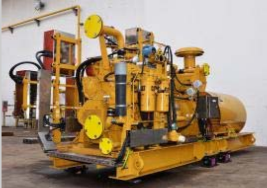
Cat Gas Engine Genset G3306

development of the Sabah Sarawak Gas Pipeline (SSGP) project will ensure the availability of gas supply to Sabah and further boost the economic activities around that region, while sustaining liquefied natural gas (LNG) production in the Bintulu complex. As the country progresses, Malaysia will continue to implement energy policies that will promote and support the growth of its economy. Policies to diversify Malaysia's fuel sources, including the promotion of renewable energy, have been implemented by the government as the country faces the possible prospects of turning into a net oil importer by the early part of the next decade.