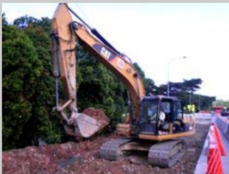
Cat 320D on a road maintenance job

Dedicated team and premium Cat® equipment spell success for Samwoh