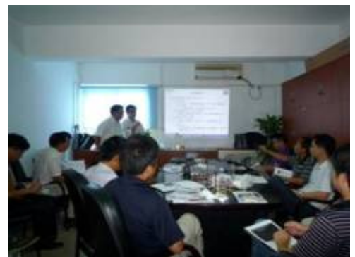
CEL's Technical Training organized for GDC