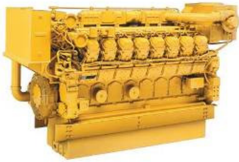
Cat model 3512B