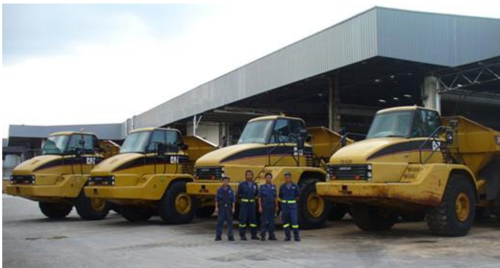
Full Range of Used Cat Articulated Dump Trucks with our Workshop Staff. (L to R) ADT Models 725, 730, 735 and 740.

Short-term projects have created a demand for used articulated trucks in Singapore. As some customers have need of these equipment for only a short duration in their jobs, they do not find it viable to invest in new machines.