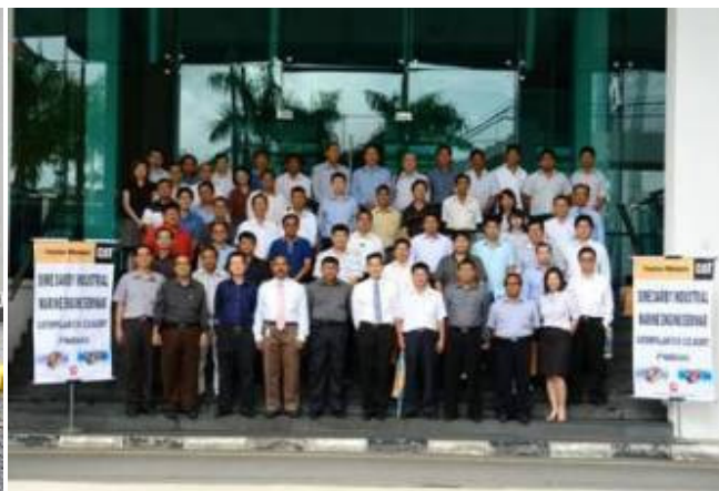
A Group photograph to commemorate the occasion with hosts Caterpillar and SDI with valued customers

The Power Systems Department (PSD) of SDI (formerly known as Tractors Malaysia) - authorized Cat dealer for Peninsular/East Malaysia and Brunei - has a number of key customers in Sarawak engaged in the logging, plantation, utilities and shipbuilding markets. There are approximately 35 major shipyards in Sarawak located at major towns and cities based in Kuching, Miri, Bintulu and Sibu. The yards here build vessels that include Anchor Handling Tugs (AHT), 20m to 30m conventional tugs, Strait Supply Vessels, utility vessels, ferries and crew boats for both local and international customers. PSD-SDI has branch networks in all these key locations to provide reliable pre-sales support and after sales services. Today, 40% of PSD’s total marine business comes from Sarawak’s marine business.