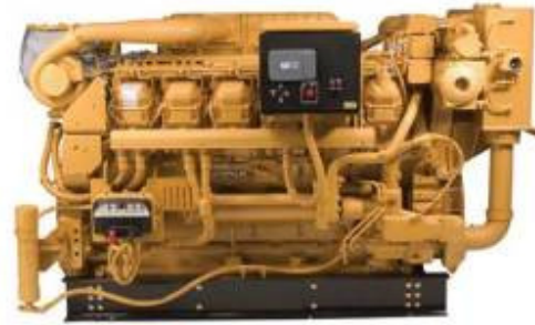
Cat model 3516B

Cat marine propulsion engines have provided proven power for many marine applications around the world. They afford excellent fuel efficiency and oil consumption, and meet the most stringent emissions standards. With Cat marine propulsion engines and the support of its authorized dealer (The China Engineers., Ltd), CCC-Guangzhou Dredging Co., Ltd and other end-users can be assured they have the most reliable, safe and high quality propulsion power at their command.