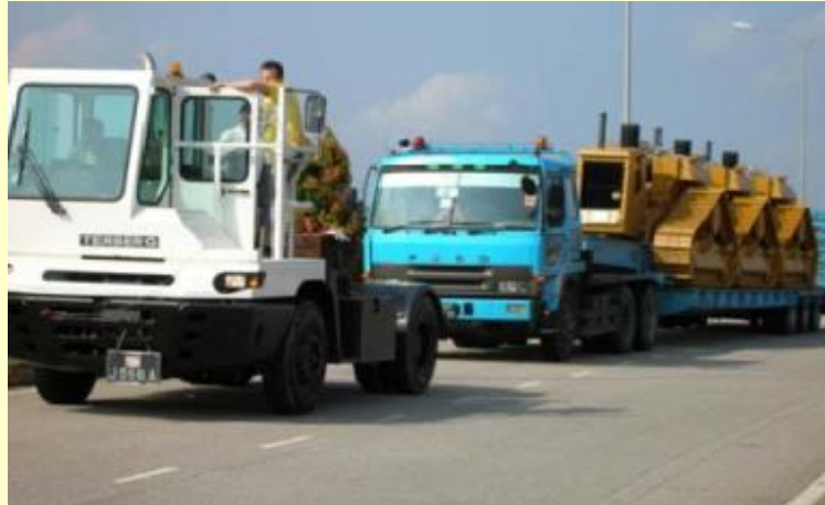
Type testing of the new C6.6 ACERT engine carrying a maximum load of 75 ton GCW.

T erberg Tractors Malaysia (TTM), Sime Darby Industrial –Power Systems Division (PSD) and Caterpillar® have innovatively put together a new CAT C6.6 ACERT engine to power the YT220-Mk2, 4x2 Terberg Terminal Tractor. This necessity emerged after the production of the previous CAT 3126B engine ceased in 2007. The best fit was found in a C6.6 ACERT rated at 173hp and 213hp. To date, a total of 120 units of the off-highway terminal tractors have been fitted with the C6.6 ACERT engines for domestic and overseas market.