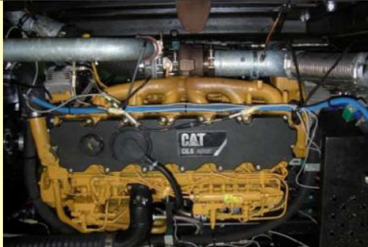
The CAT C6.6 ACERT engine: Easy fit, fuel efficient, and environmentally friendly