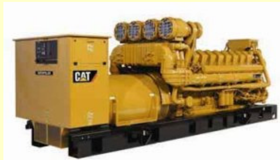
Cat C175 Diesel Standby Genset

The Cat C175 diesel standby genset is but one of Caterpillar's extensive range of quality products. Fujian Media Group can rest assured when CEL delivers the 2 units of C175 in March 2009, that it has bought the best product for its needs coupled with the best support behind it – The China Engineers, Ltd. a member of the Sime Darby Group, and the authorized Cat dealer for Hong Kong, Macau, South China and Xinjiang .